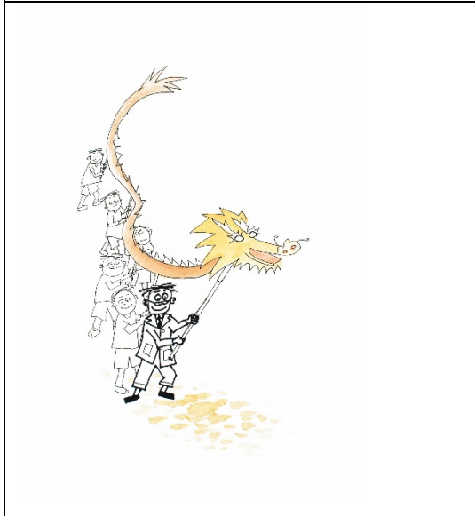
Photo 2: The cartoon exhibition entitled “ Auspicious Drawings ”, displays 52 original drafts of Yeung’s illustrations for A Life Story of Mixed Emotions .