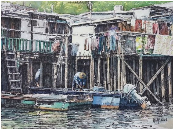
The Boat People Hui Chiu Ki Watercolour with pencil 2023 30 x 40 cm