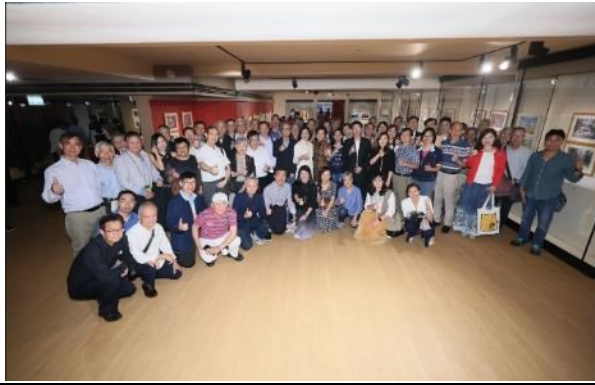
Photo 6: Officiating guests and the participating artists at the opening ceremony of “Peaceful Colour” exhibition.