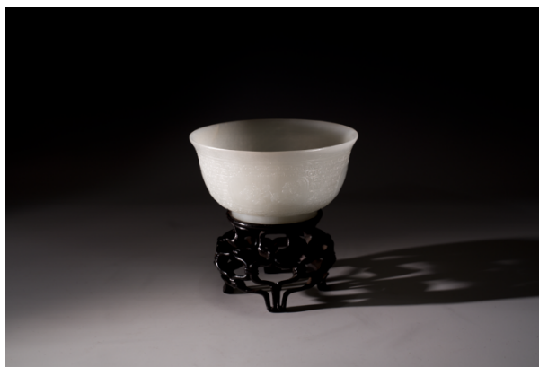
An imperial White Jade cup Qing dynasty, Qianlong period 10.1 cm