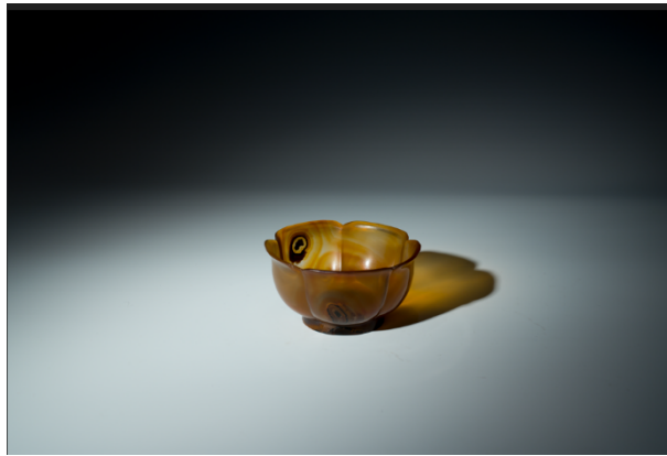
A Thumbprint agate lobed bowl Northern Song dynasty 8 cm