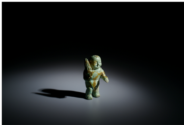
A Turquoise boy holding a sheng Jin dynasty 4.7 cm